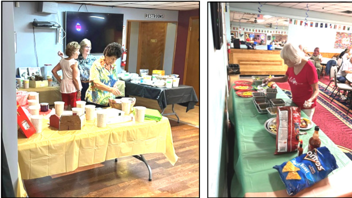
Good Food - Good Friends