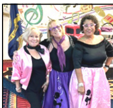
Sock Hop per Bob's Wishes