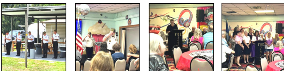
VFW Post 4287 Ceremony