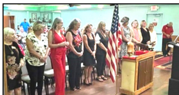
New Officers Awaiting Installation